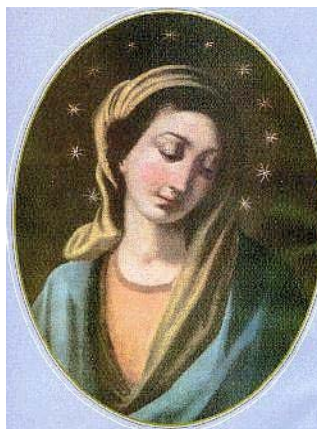
A portrait of the Blessed Virgin Mary painted by Alphonsus.

Alphonsus' health suffered as he aged. He became so crippled that he couldn't raise his head to drink from a cup or glass. He finally retired as bishop in 1775 and returned to his congregation. In 1778 he published the last of his 111 written works. His final years were marked by more turmoil in the order he had founded and his increasing frailty. He died on August 1, 1787. That anniversary, August 1, is celebrated as his feast day.